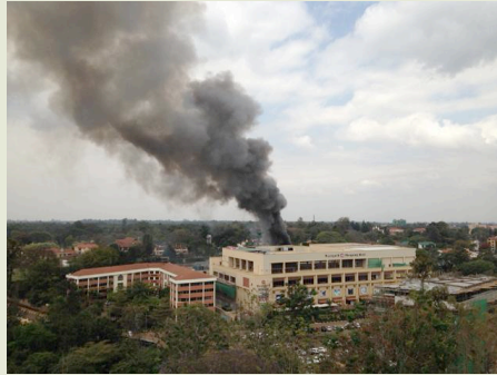
Smoke rising from the Westgate Mall in Nairobi, Kenya's capital, after the attack.

At the Westgate Mall, as it is named, more than 1,000 people