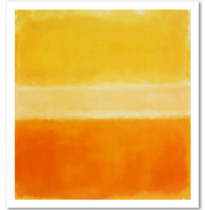
Yellow and Gold by Mark Rothko

But, another odd thing, was that there were people surrounding the object. The people were crying, wailing out for the object, reaching out for the object, but never being able to grasp it. As time, went on, the arms of the people, grew to amazing lengths, but as did the distance between them and the object. Something truly odd, was that with each time that the object changed forms, so did the people surrounding the object. When the object was a ruby-red rock crystal, the people were hooded monks, travelers, and old men; But, when the object was a golden liquid in a bottle, the people changed into young men, whose time weighed heavy in the text. Finally, the object and the people, began to change into something new. As the object changed, the scientist's alarm went off, and he woke up. The scientist woke up feeling cheated out of closure, but he shrugged it off. He got up, and went to his bathroom, opening up his cabinet, where all his medications and cosmetics were; and, at the speed of thought, he knew what the object from his dream was going to turn into. He closed the cabinet, and looked into his mirror, into his own old and withered face.