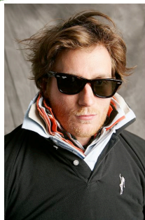
2. Anything & everything by Ed Hardy