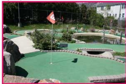
Miniature golfing only available at Magoo's

ICE CREAM COMPANY 190 VFW Drive, Rockland, MA 02370 T: 781.871.0210