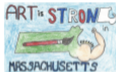
2016 YAM State Flag

(Closed weekends and President's Day, Monday, Feb. 15, 2016)