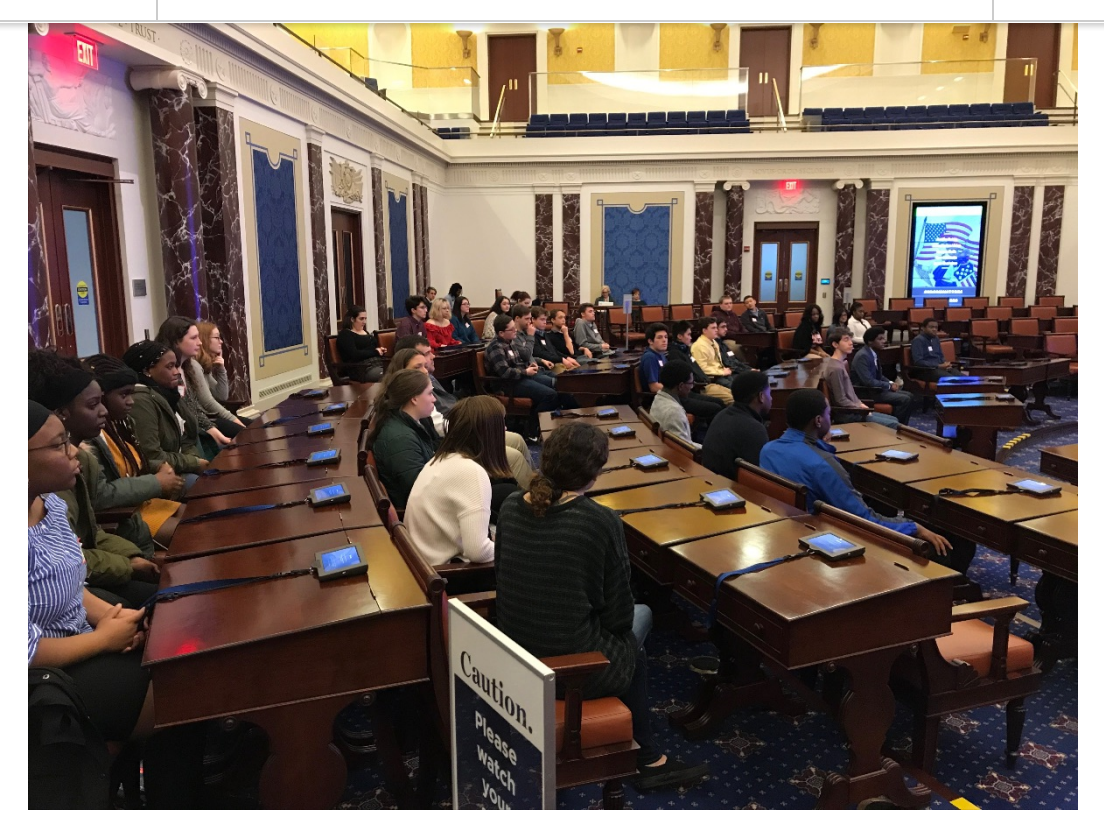
Students waiting to be sworn in as members of the United States Senate.

On Wednesday we had the opportunity to see our high school history curriculum come alive. Juniors ventured to the Edward M. Kennedy Institute for the United States Senate to learn through simulation about the inner workings of the legislative branch of government. Upon arrival, students were sworn in and took on the role of a U.S. Senator representing a state as a member of the Republican, Democrat, or Independent party. In this role students reviewed the merits of a comprehensive immigration reform bill scheduled to be voted on later that morning.