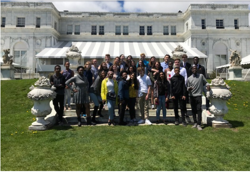
Students in 10th grade ELA enjoying a day at the Newport Mansions.

I would like to thank all families who took the time to complete the Annual SSCPS Parent Satisfaction Survey. The results of the survey have been recorded and the quantitative data is linked here for your review. This survey data will be reviewed during the May Board of Trustees meeting tomorrow evening. We received 106 responses from 650 families. This is a solid response rate, however not as high as last year. Last year we received 223 responses out of 587 families. In 2017 we received 114 responses from 493 families. Our highest response rate was in 2016 when we received 166 responses from 372 families.