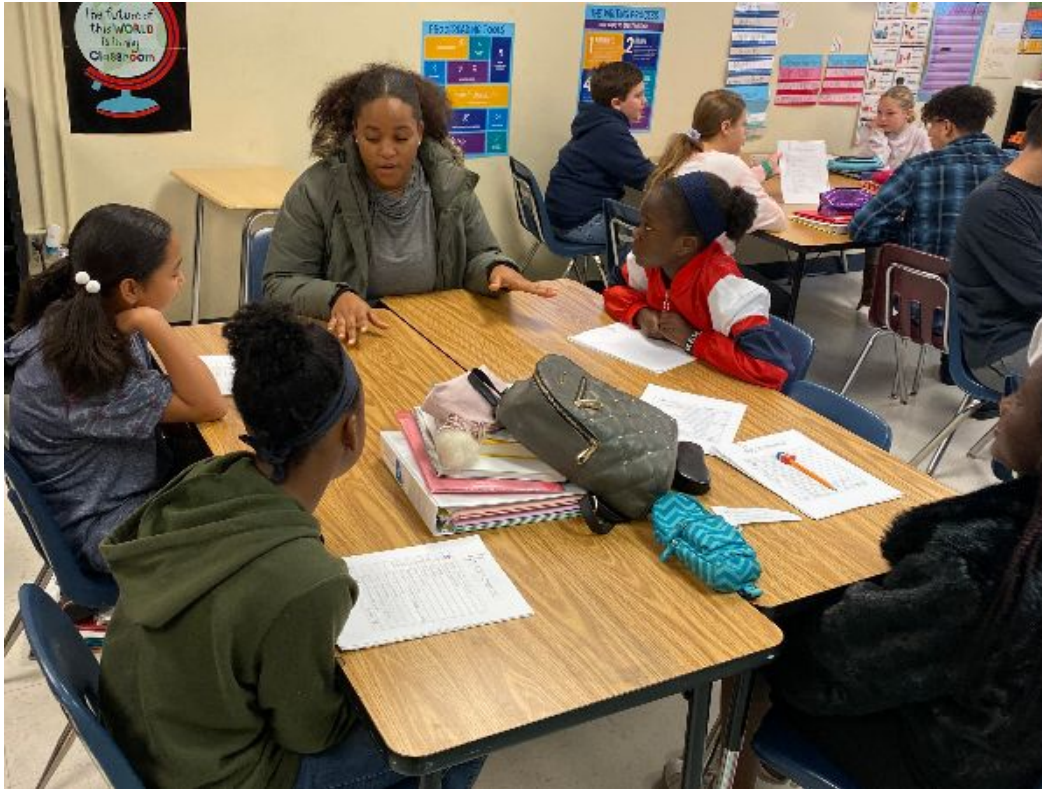
Science Fair Preparation - 6th Grade Students Working with High School Mentors