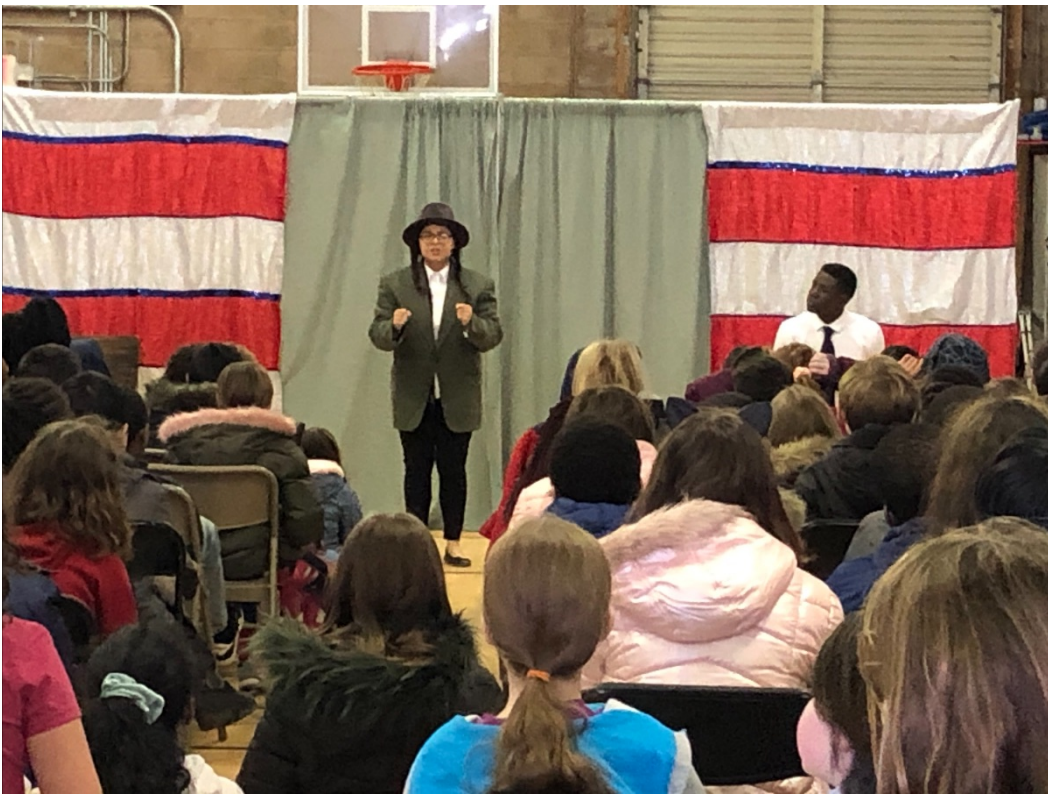
Let Freedom Ring: Music & Poetry Of Black History Bright Star Theatre Performance | January 2020