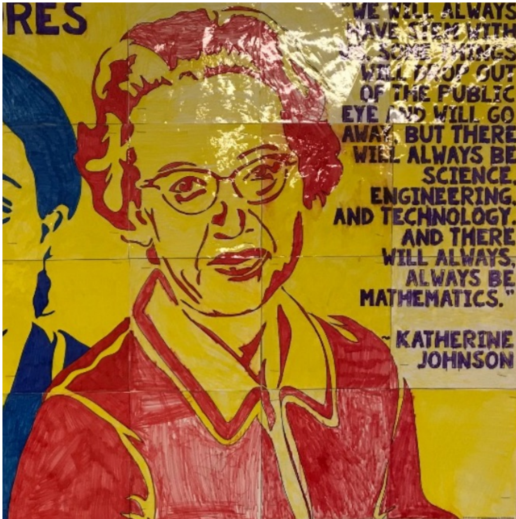
Katherine Johnson NASA Mathematician 1918-2020