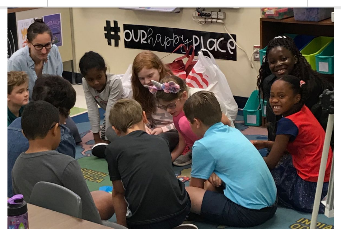
Happy to be back on Level I August 2019

As we look forward to an exciting new year, we welcome new faculty and staff members to the SSCPS community.