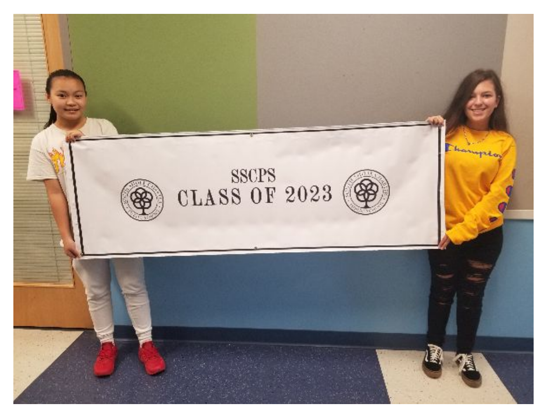
Freshman Class of 2023

Also last week our ninth-grade students participated in Freshman Convocation, coming together as a class for the first time, as they kicked off their high school careers by participating in community building activities, asked questions, and explored the high school before the arrival of our upperclassmen. The Freshman Convocation is one step that our community is taking toward meeting the goals that the <u>School Council</u> incorporated into our <u>School Improvement Plan</u> last year. The final document was approved by the <u>Board of Trustees</u> this summer. The School Improvement Plan outlines some of the areas that we are working on as we work to achieve our mission.