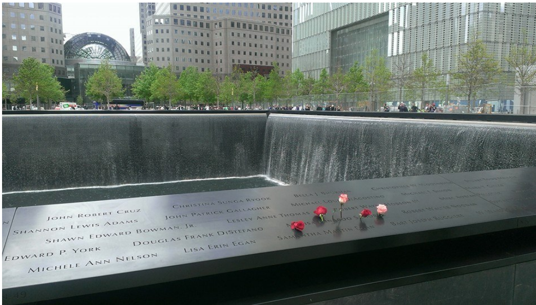
9/11 Memorial, New York City