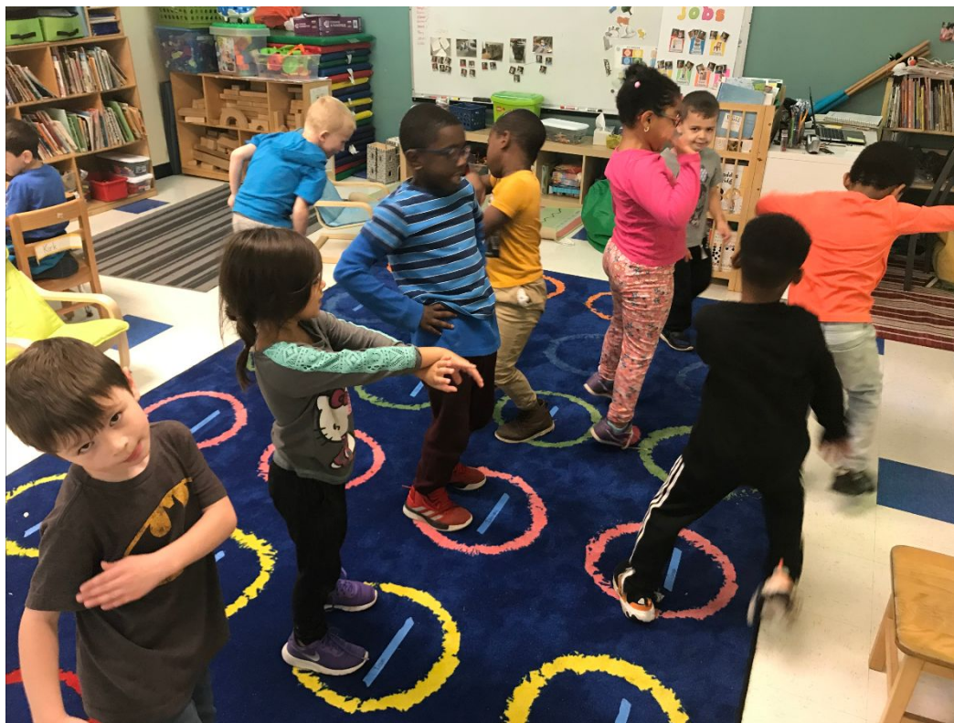
Kindergarten finished up their last week of Latin Music FIT practicing dances and rhythms from salsa to the macarena.

At SSCPS, our elementary Spanish program sets us apart from other public schools, with our K-6 Spanish program. Giving a child a head-start in today's world by speaking a second