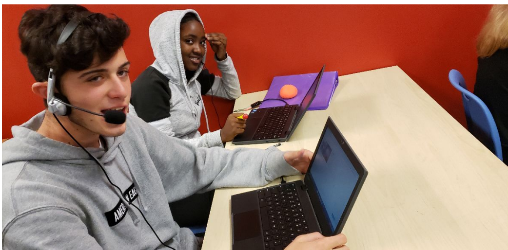
Students in French I participating in a video chat with a classmate.