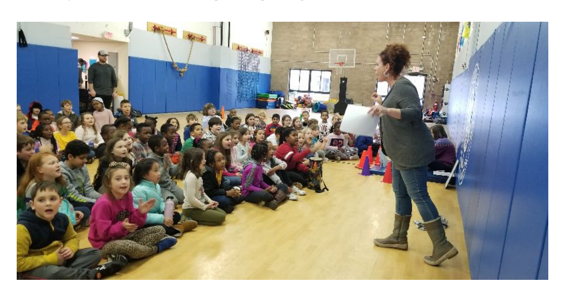
Level I Winter Concert Rehearsal

December is both busy and exciting as students and teachers work to finish projects and wrap up curriculum units as the winter break approaches. As a school, we have a number of December traditions including Exhibitions of Mastery, our Winter Concert Series, and Craft Day that mark the season and help us close the calendar year. Walking down our hallways this week I could hear our youngest students in their final rehearsals for this evening's K-4 concert. The concert will take place at Hingham High School, 17 Union Street, Hingham. This special event is always well attended and parking can be difficult. Be sure not to park on the street as you will be ticketed. A map of the parking areas can be found here.