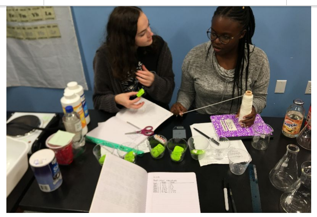
Students working on an inquiry-based investigation on the properties of water

Aside from being a time for celebration, we are at an important point in the school year for reflecting on our progress. At last Thursday's meeting of the School Council, the group reviewed our work toward meeting the goals outlined in the School Improvement Plan. The Council completed the progress monitoring section of the plan that allows us to keep track of our work and follow-up with responsible parties to continue moving forward. Our completed fall progress monitoring chart for the 2019-2020 School Improvement Plan can be found <a href="here">here</a>. We will continue discussing the plan in School Council meetings as the year goes on. School Council meetings are open meetings and all are welcome to attend.