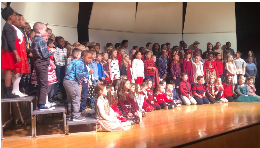
Level I Students Ready to Sing at the Winter Concert

December events have quickly flown by bringing us to the last week of school for 2019. These past weeks have been filled with many events of the season. Before we look to tonight's second Winter Concert and all of the excitement of Craft Day on Friday, there is much to look back on with a sense of accomplishment. Here we are in our 25th year; the hard work of our students, faculty, and families continues to define our mission as a K-12 charter school. Within the past four months we have witnessed continued academic excellence, dedication to service, and athletic accomplishments that have made our school proud. As we watch our students complete their Exhibitions of Mastery, organize blood drives, or win basketball games, we truly understand what it means to be part of the SSCPS community. We are delighted with the work of all of our students K-12, and it remains a privilege to witness their growth at every level.