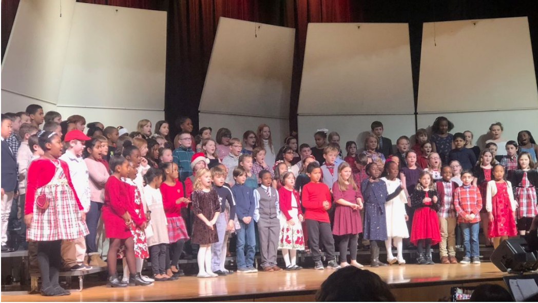
Winter Concert 2019