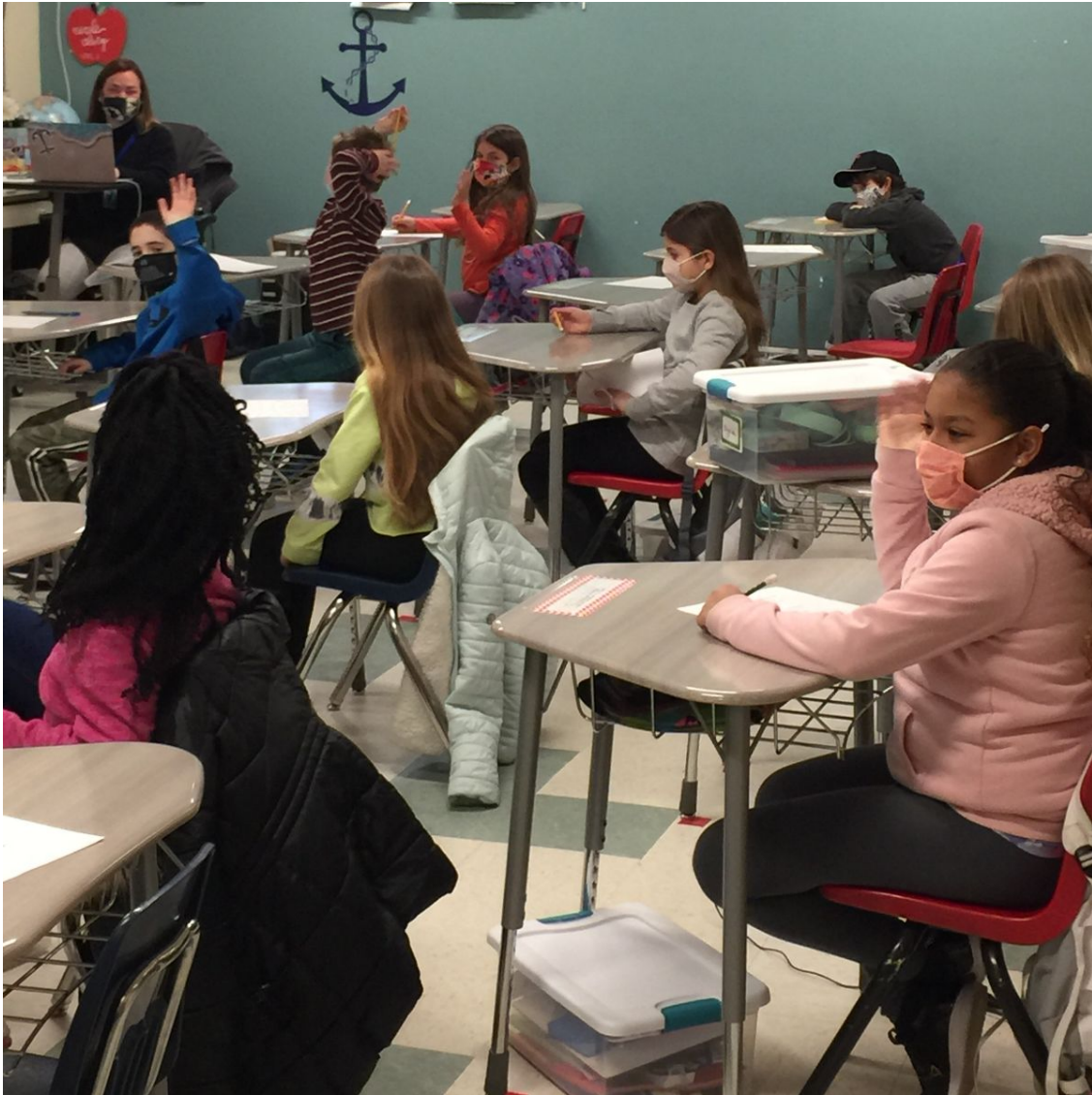
Classroom Morning Welcome

Yesterday the Massachusetts Department of Public Health announced that a backup PCR test would no longer be required for Abbott BinaxNow rapid testing. This means that the Abbott BinaxNOW rapid antigen test, which we perform here at school, may be used as a final result for close contacts and symptomatic individuals. This is excellent news as it has the potential for limiting learning disruptions and finding positive cases within our school community with one step. Information on how to sign your child up for each of the testing programs is below.