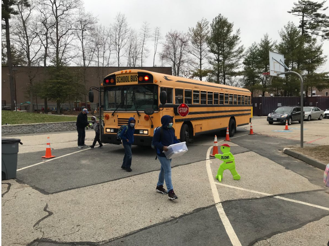
School Bus Welcome April 5, 2021