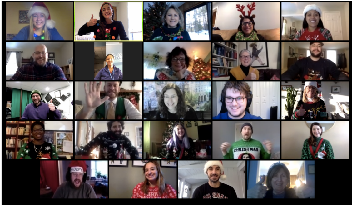
High School Faculty and Staff Ugly Sweater Day