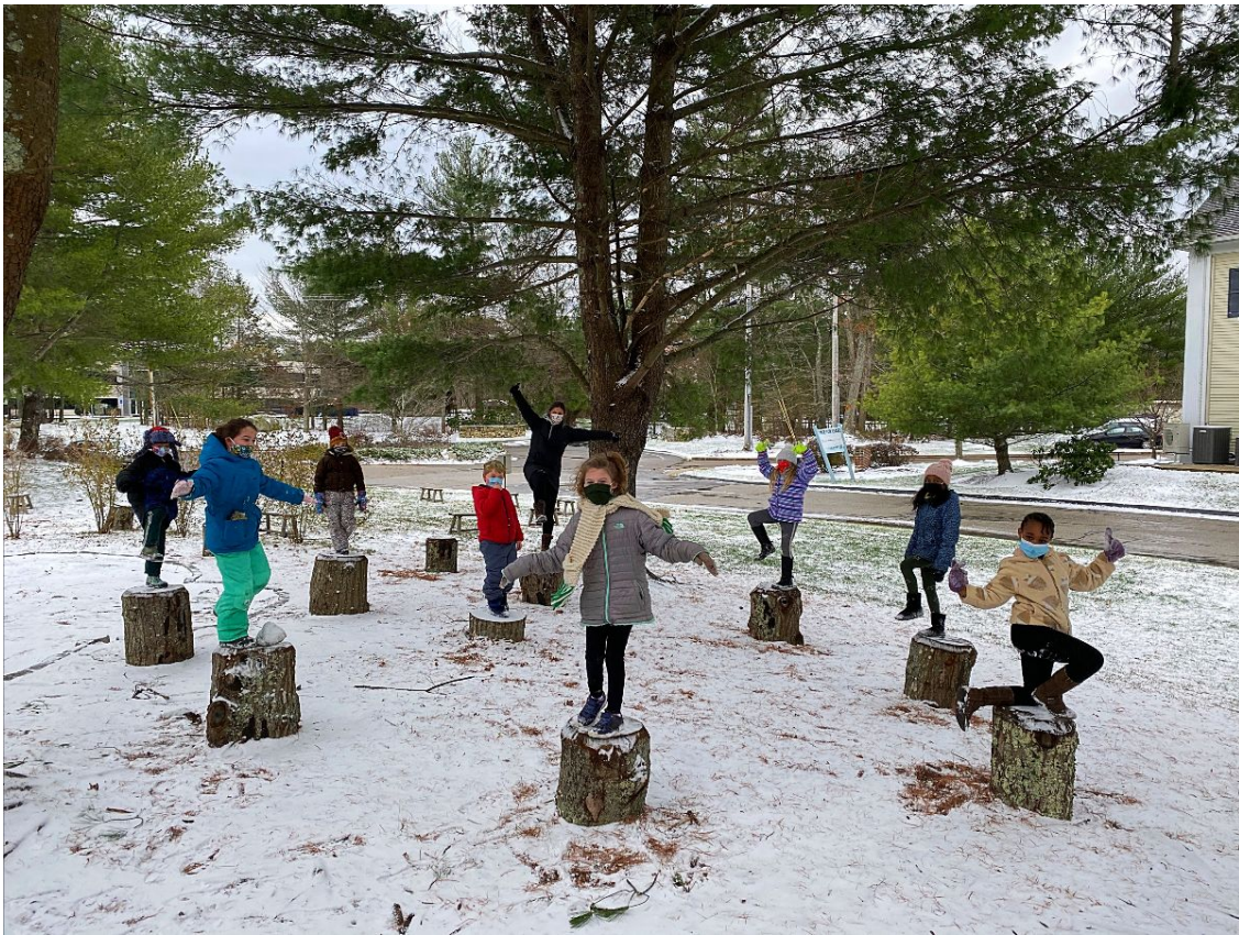
Level I students enjoying the snow in the outside classroom.