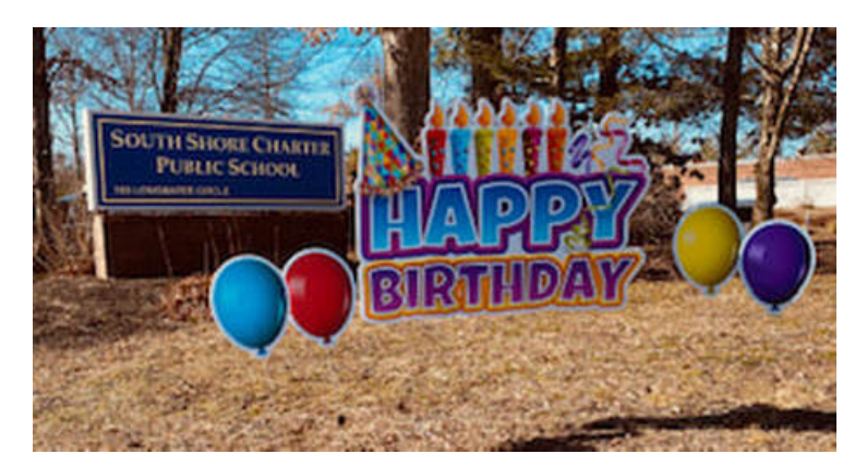
Send a Big and Bright Birthday wish that everyone will see! Sign up here to rent our Birthday sign. https://sscpspa.weebly.com/birthday-sign.html