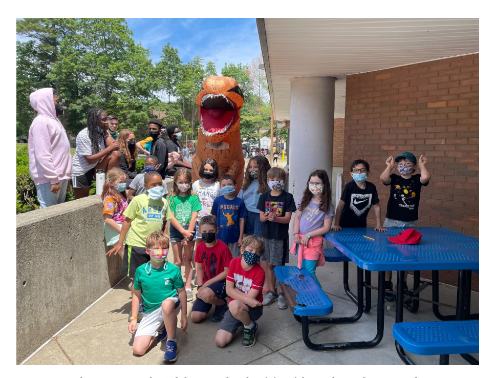
Students on Level I Celebrate school spirit with students from Level IV.