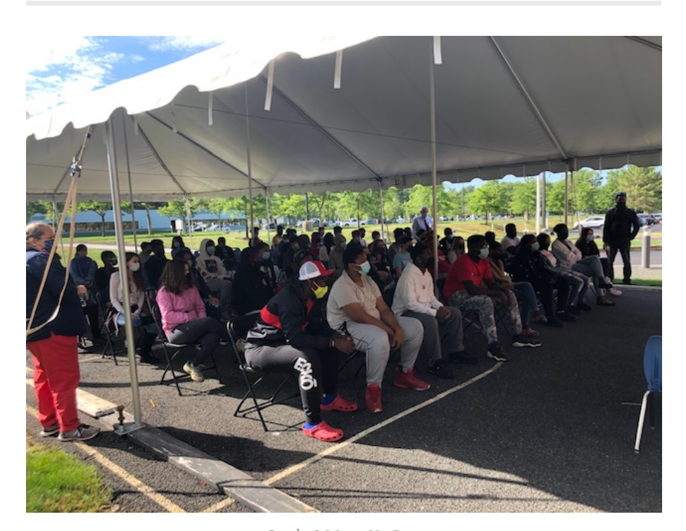
Grade 8 Move Up Day