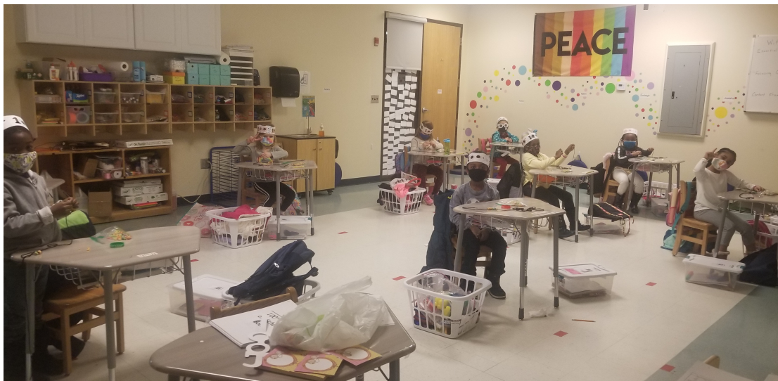
Kindergarteners celebrating 100th day of school!

This month the Department of Elementary and Secondary Education released its school report cards for Massachusetts public schools and districts. The report card provides information from the state accountability system, bringing together a set of measures around school performance. Our accountability results are calculated using data from several sources including MCAS, student attendance, high school completion, and enrollment in advanced coursework at the high school level. Our 2020 school report card can be accessed here . A cover letter describing the school