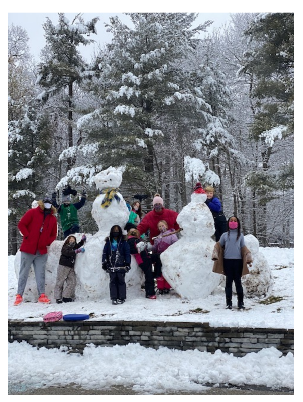
Level I Students Building Friends | January 27, 2021