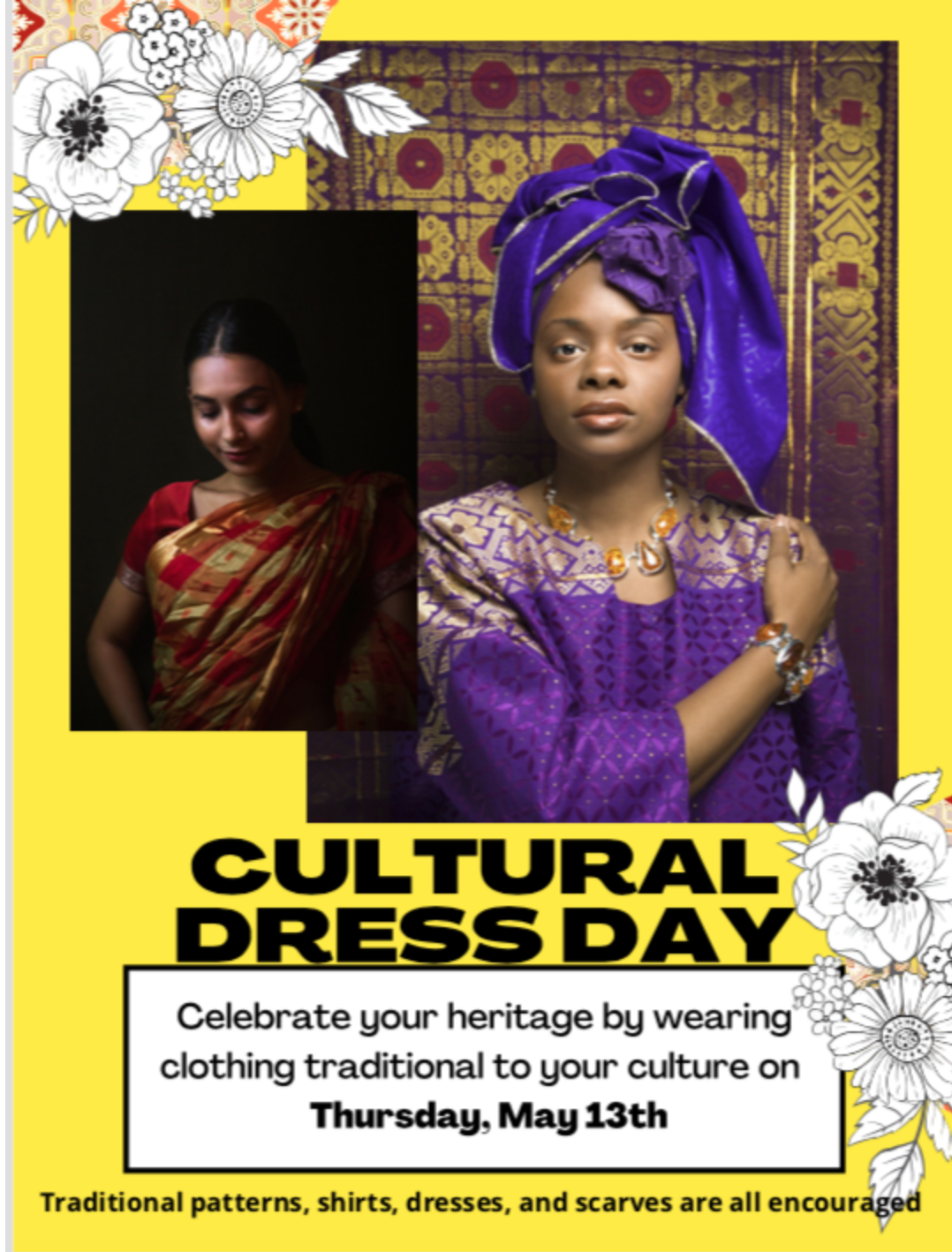
Cultural Dress Day Flyer