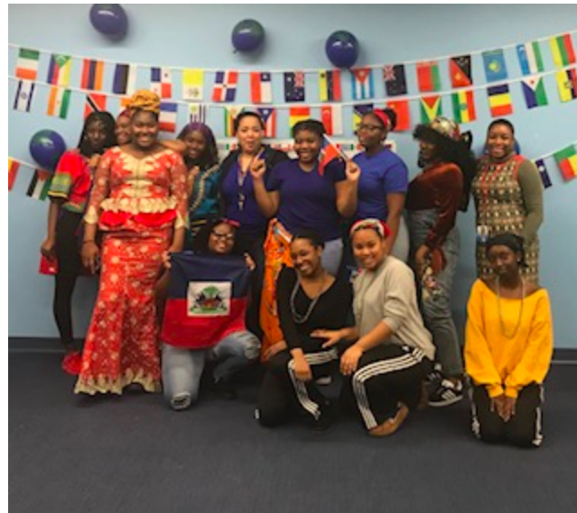
Cultural celebration and flag day celebration at SSCPS from previous years