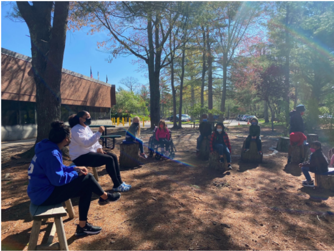
Kindergarteners enjoyed visits with some of our graduating seniors.