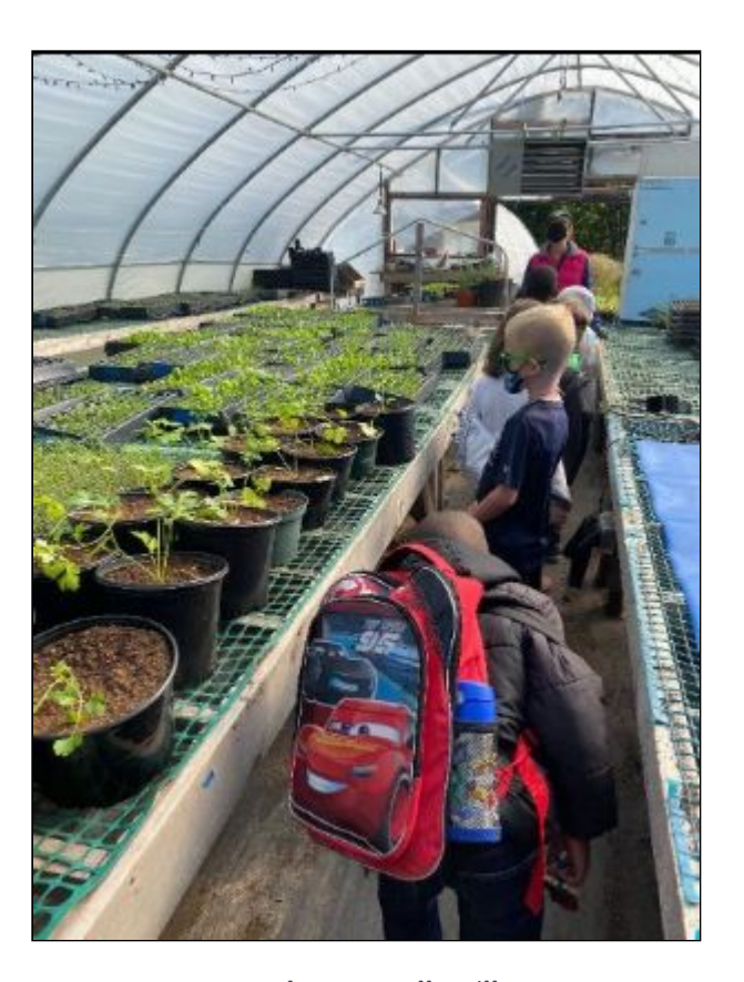
SSCPS Students at Holly Hill Farm