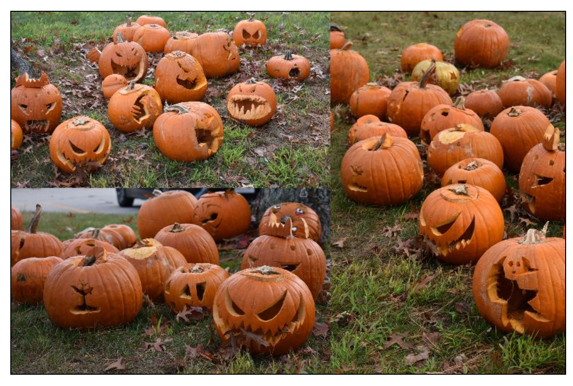
Level III students continue the tradition of carving pumpkins for the New England Wildlife Center's Night of a Thousand Faces.