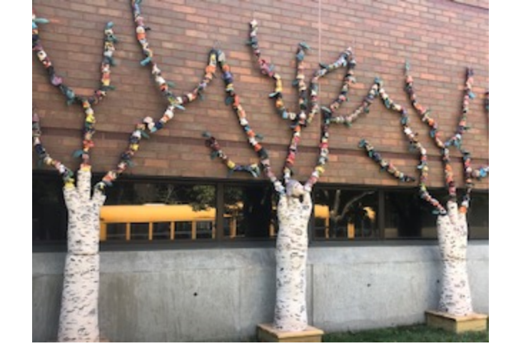
The SSCPS Friendship Tree Sculpture