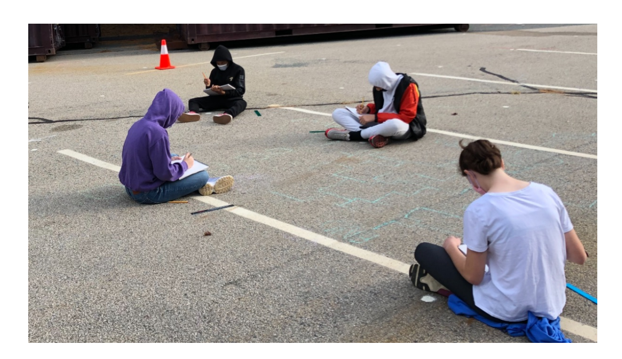
SSCPS students sketching for art class at 100 Longwater.

welcomed a new tent at the high school which will provide an additional area for learning and recreation.