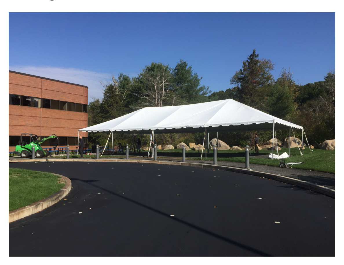
The new tent at 700 Longwater Drive installed earlier today.

Here we are in the first full week of October and the momentum of the school year continues to be exciting. Throughout SSCPS students are busy learning and moving, all the while diligently following safety parameters and heath guidelines. Over the summer as teams discussed and planned what the new year would look like, it almost seemed impossible to imagine. Yet, working through each guideline and recommendation, it became easier to envision the school's reopening. Now that we are a four weeks into the new year, it is evident that the day to day learning progresses and runs parallel with our need to be flexible. Today we