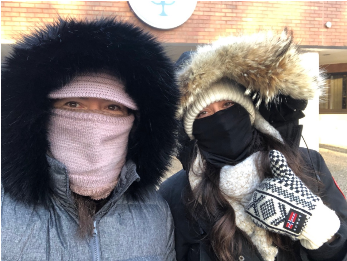
Brrr! Our front door greeters are bundling up in the cold weather at 100 Longwater. Stay warm everyone!