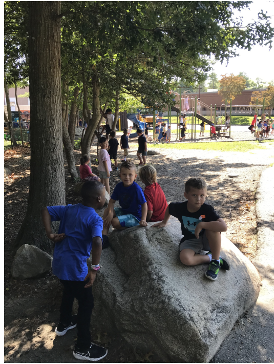
First Day of School - August 30, 2022.