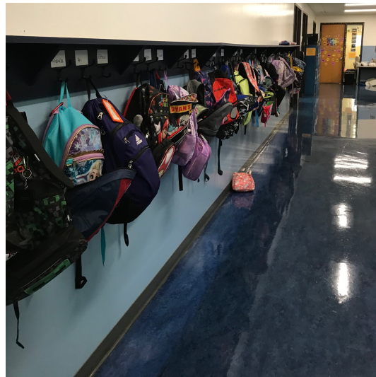
High School classroom entrance (left) and student backpacks on Level I (right).