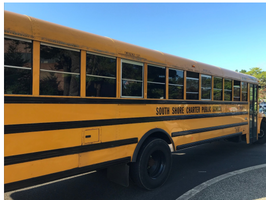
Rolling in and ready to learn. First Day of School - August 30, 2022.