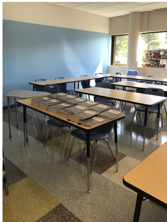
Classrooms in Level I (left) and the High School (right) ready for the first day of classes.