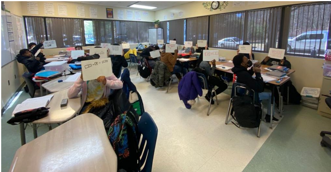
White board solutions in Chinki's classroom