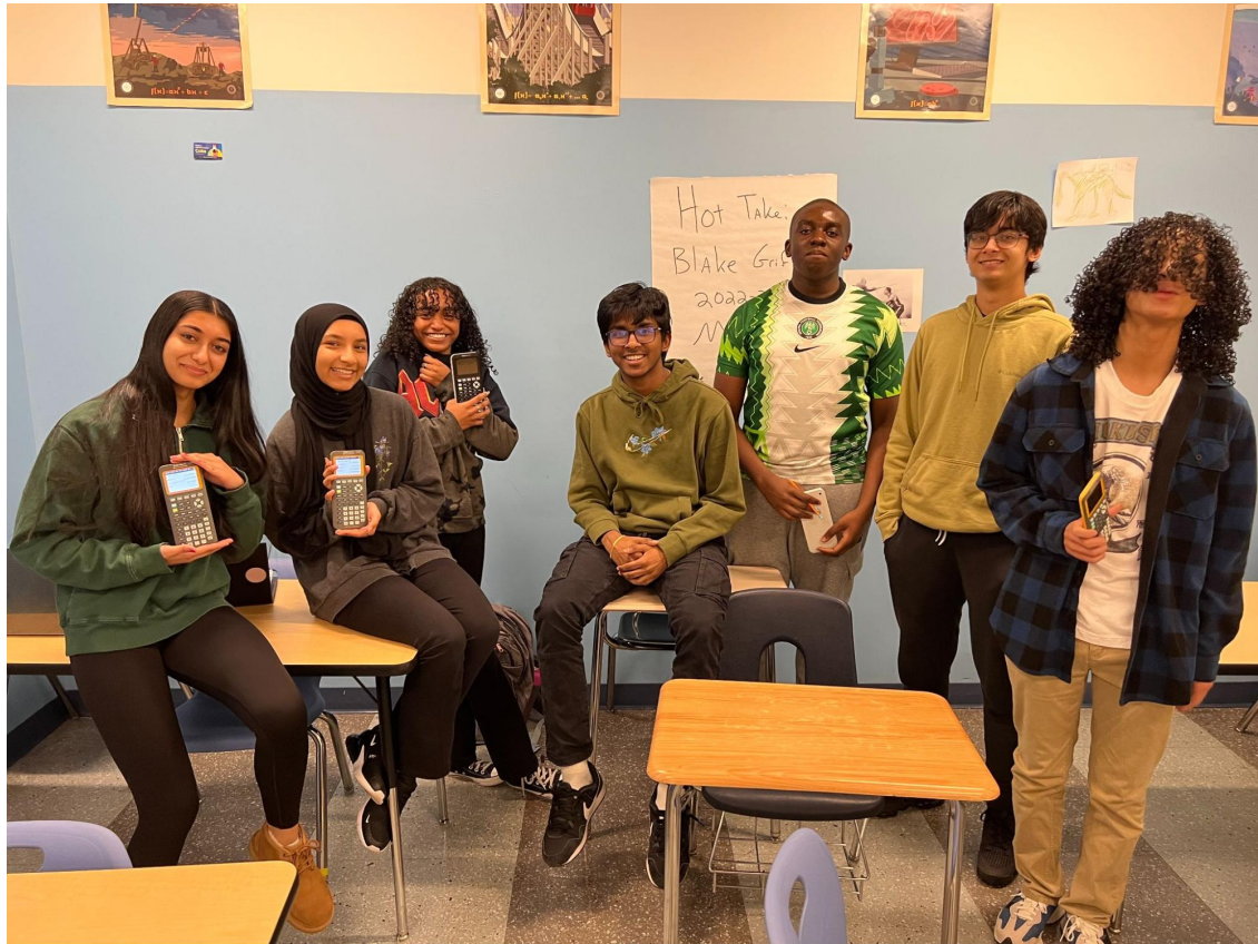
Juniors in AP Statistics

moving at college board level pacing. Their dedication to learning is at the forefront and they are motivated to set up a foundation of success for their future college majors and careers. The AP statistics students are currently in the early stages of inference testing. They have just learned how to perform a significance test for 1 sample proportion. The AP Calculus AB students and AP Calculus BC students are working through contextual applications of differentiation. Most recently, students are calculating related rates using derivatives. AP Calculus students also learned how to use the derivative to find where profits can be maximized using the marginal cost and marginal revenue functions.