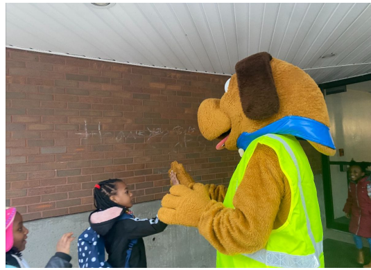
Safety Dog greets students to remind all about bus safety.