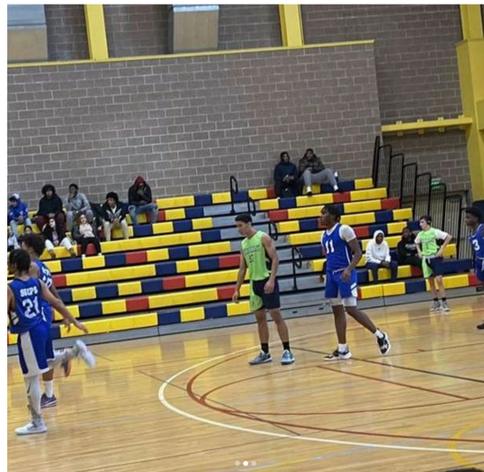
Boys Varsity Basketball team win 46-34 against Boston Collegiate