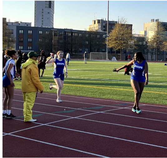
High School's First Meet of the Season