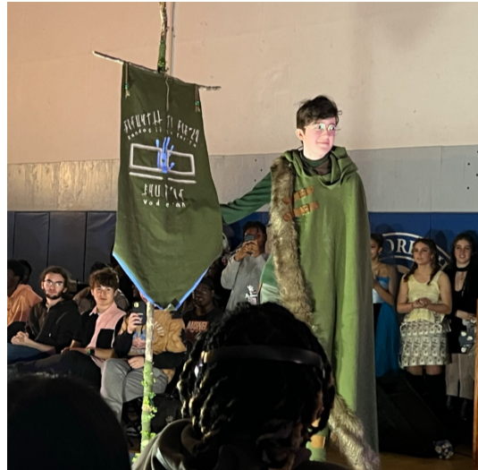
Take a sneak peak of the April 28th Fashion Show More photos to come!