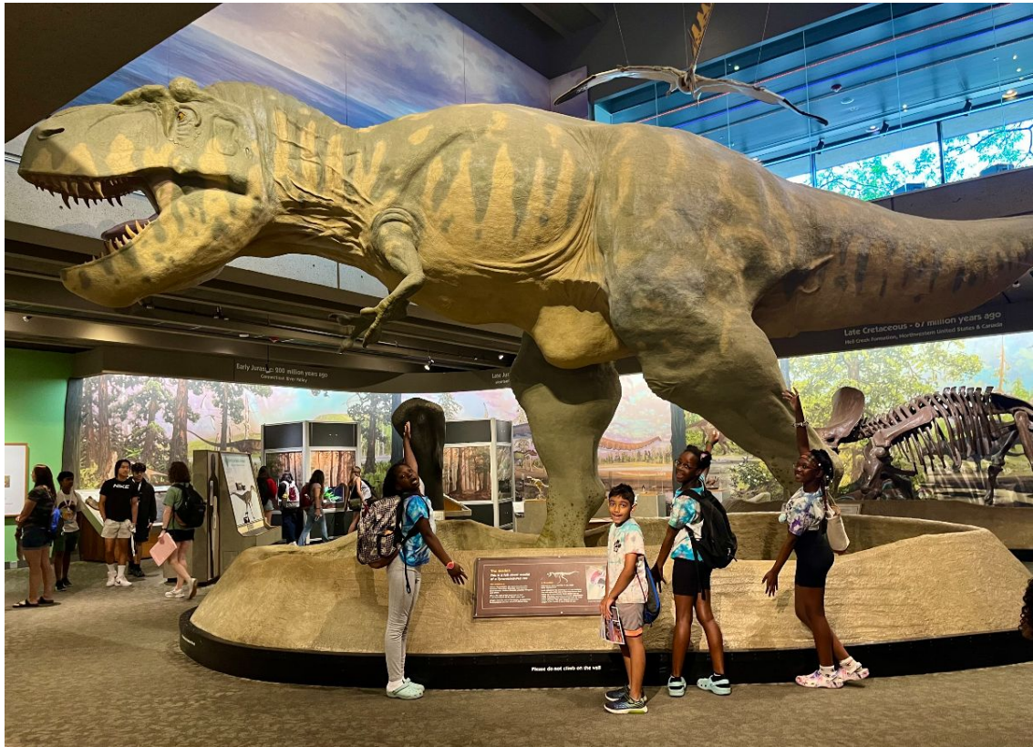
Museum of Science